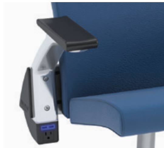
Power pod with standard arm

Passengers can charge laptops, tablets, phones, MP3 players and gaming devices using Place's integrated power units. Each seat can be equipped with an AC connection and two powered USB ports. Blue LED lamps indicate that power is available.