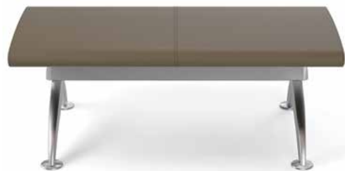
48" Upholstered Bench