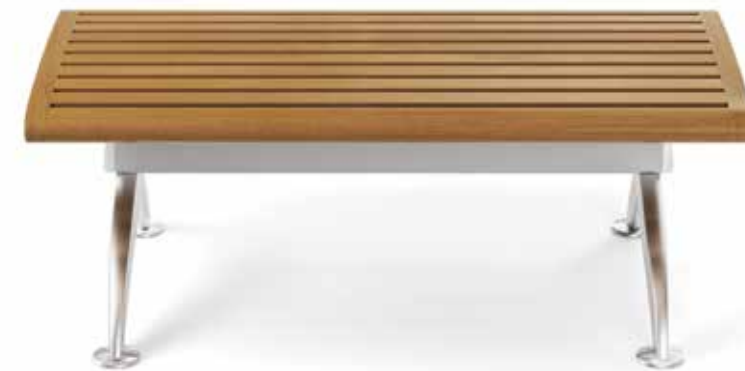
48" bench shown in oak