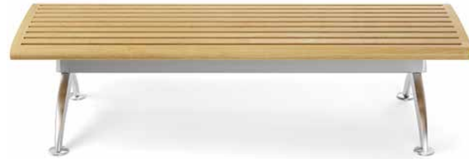
72" bench shown in maple