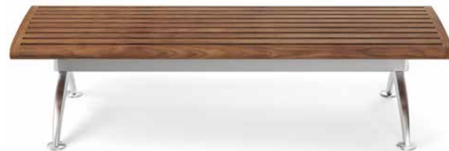
72" bench shown in walnut