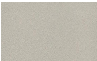
59/93370 Silver Metallic