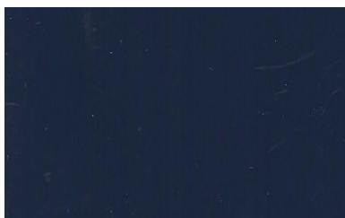
5003 Deep Blue