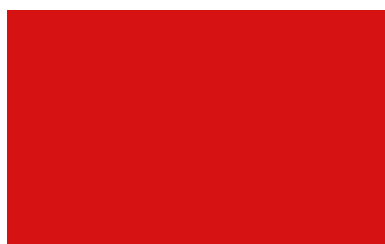
3000 Bright Red