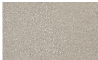
2502 Cloud Silver with Clear Coat