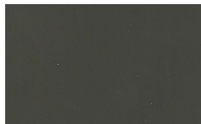
7015 Charcoal Grey